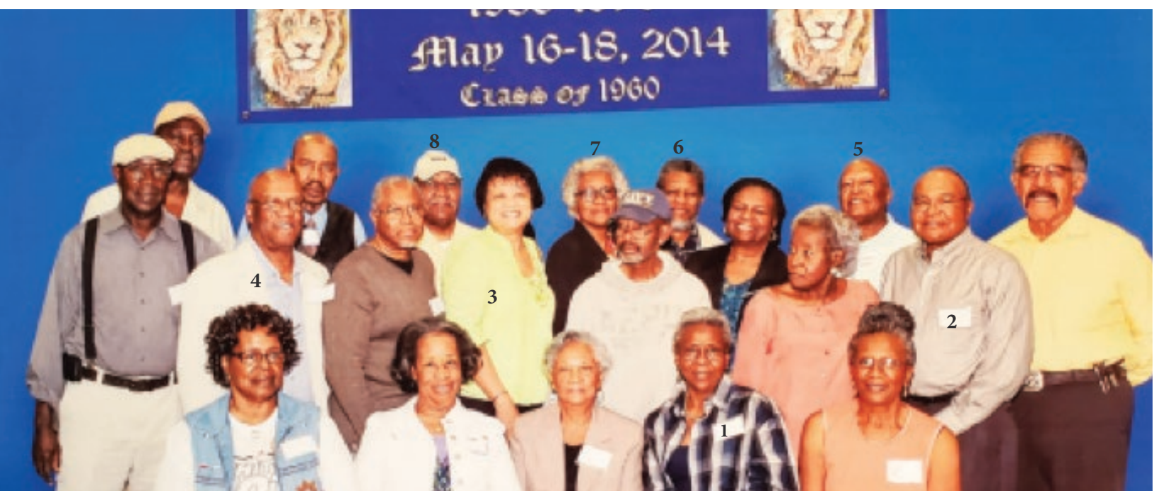
Pictured above are members of the Carter-Parramore High School Class of 1960, at a super reunion of all classes, held in 2014.