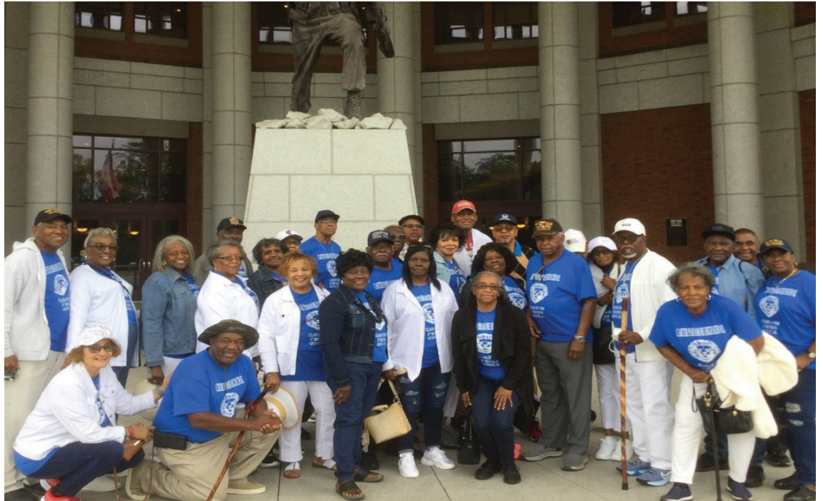
Photo taken at the entrance to the National Infantry Museum, Columbus, GA (classmates, spouses and guests).

Greetings from the Lions and Lionesses of Carter-Parramore High School Class of 1966 (The Class). This awesome Class celebrated its 57th High School Class Reunion on Thursday through Saturday, May 18-20, 2023, in Quincy, Florida. The Class theme "We've Come This Far by Faith" is a testimony to our desire and faith that we will continue to reunite and fellowship in future class reunion settings. Those in attendance were excited about the opportunity to return to our roots again, to commemorate the classmates, administrators and educators who have passed on and to celebrate the present. More importantly, to reminisce and recall our high school experiences through words, music, and expressions of humor where it all began -- within the classrooms, the hallways, and the entire campus of Carter-Parramore High School (CPHS).